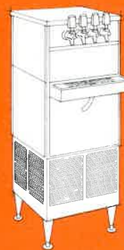
L-1 Four attractive 6" tapered legs with leveling screws. Legs screw into regular leveling screw holes in base.